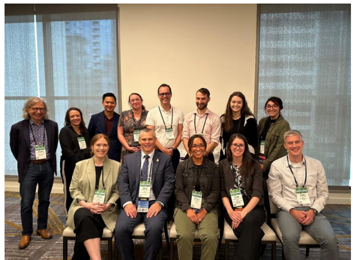
AIRS SIG Social Hour Attendees